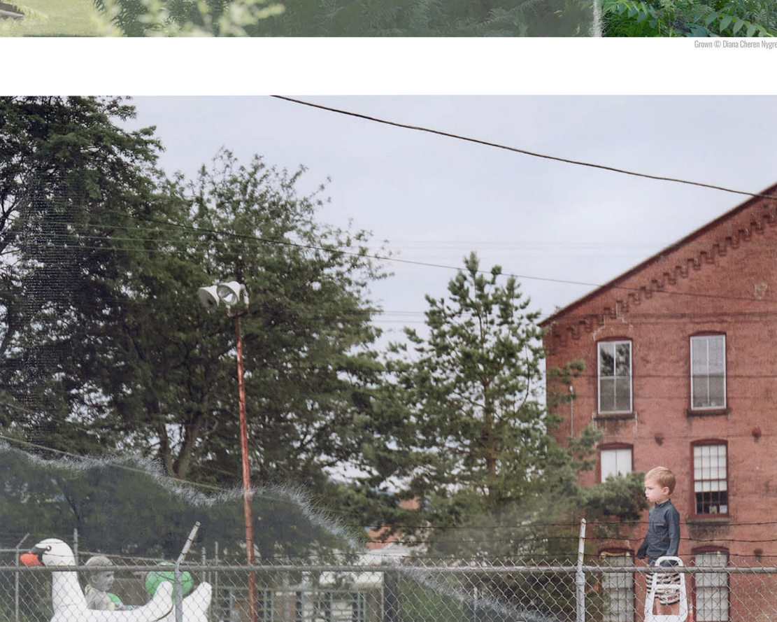
From Out And Up © Diana Cheren Nygren