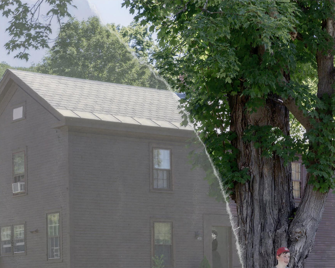
Playing With