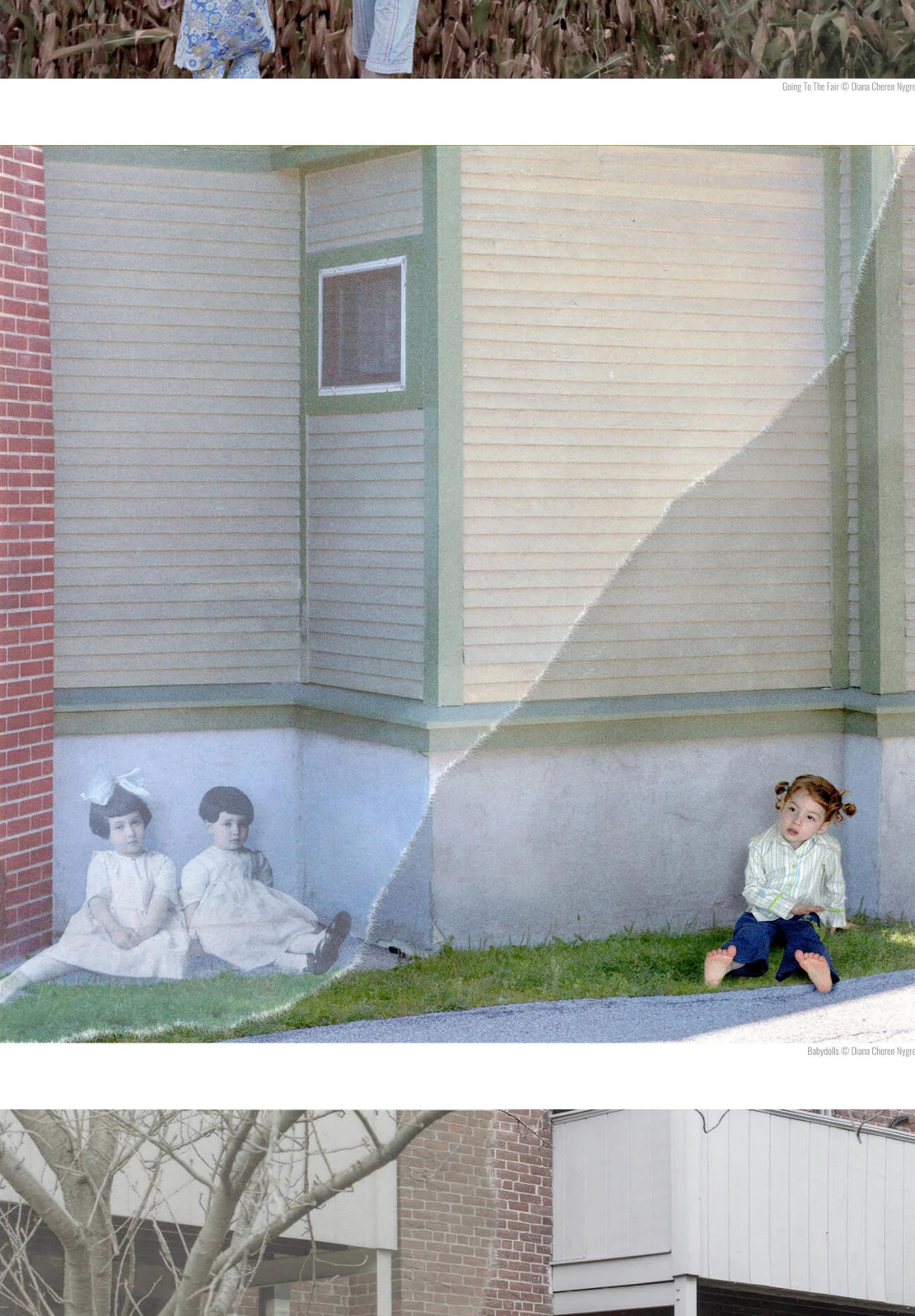
Along To The Top © Diana Cheren Nygren