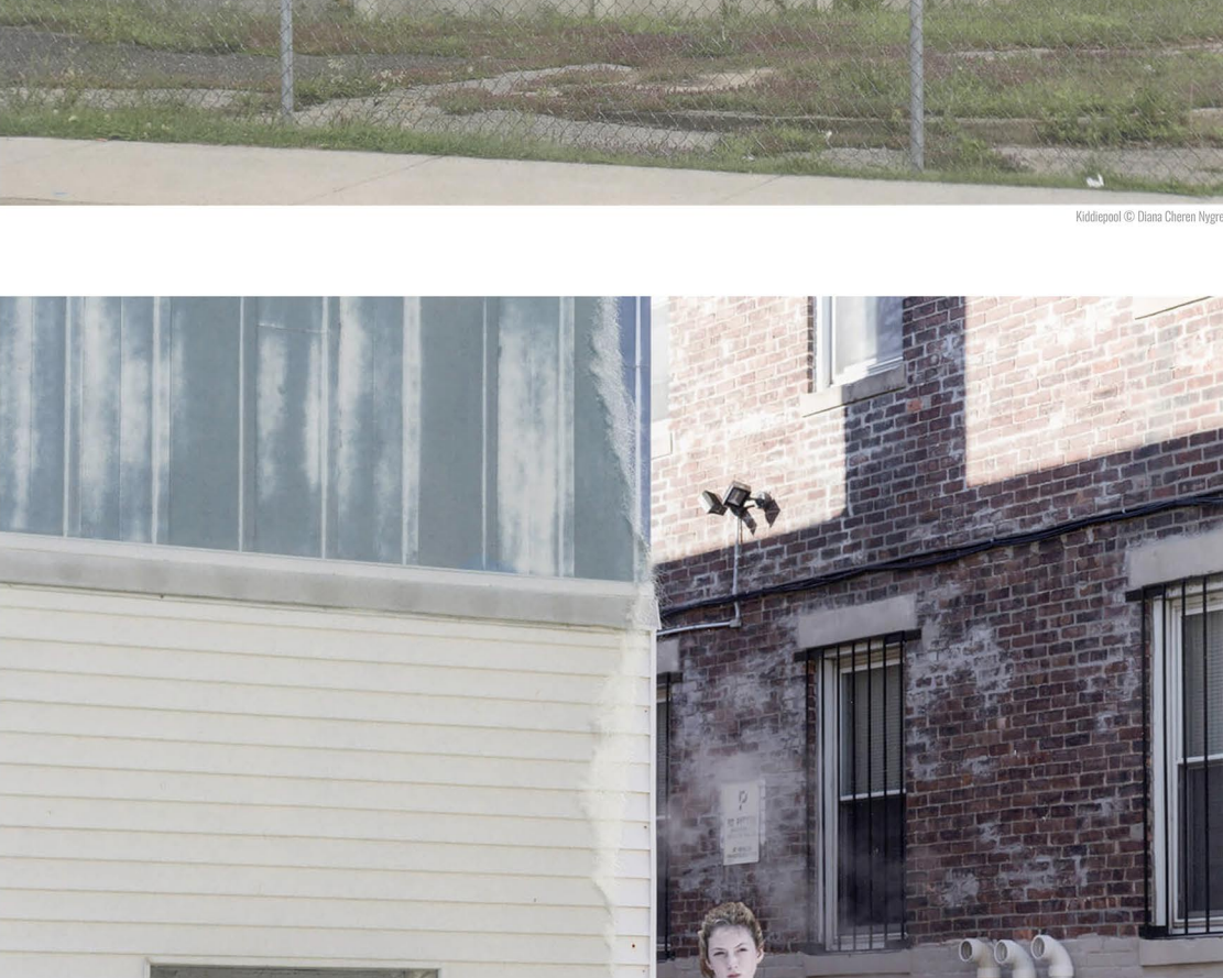
Remember © Diana Cheren Nygren