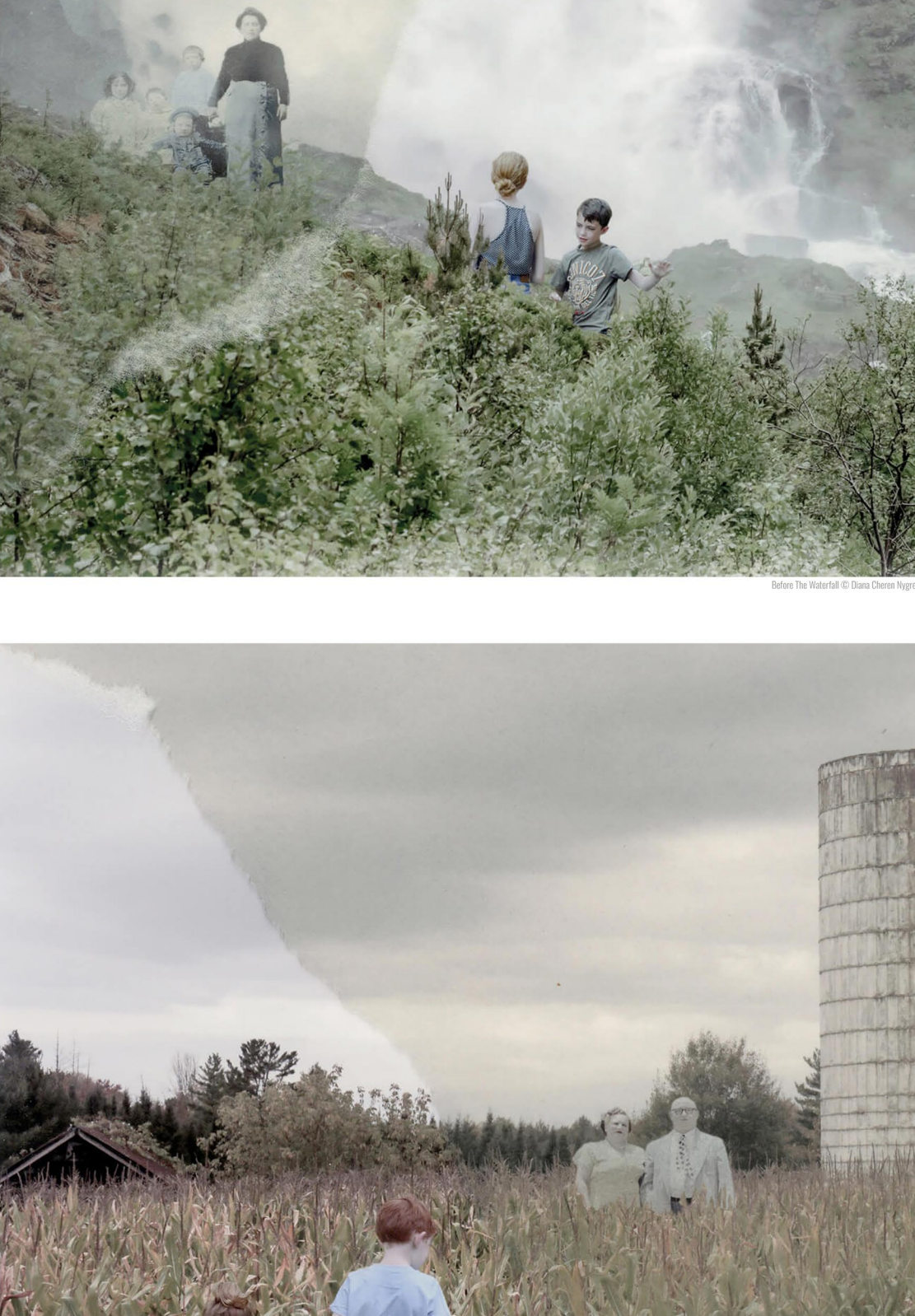
From The Forest © Diana Cheren Nygren

The images in this series are composites of my old family photographs, photographs I took of my children as they grew, and the New England landscapes in which my children and I grew up and became people. With these images, generations reach for each other across time. They are also, in many ways, self-portraits. I exist in the tension of the space between those who came before me and those who will come after. Their longing makes real those things I hold dear. Ultimately, "The Persistence of Family" portrays the layered process of becoming, and the complex interweaving of time, place, and identity.