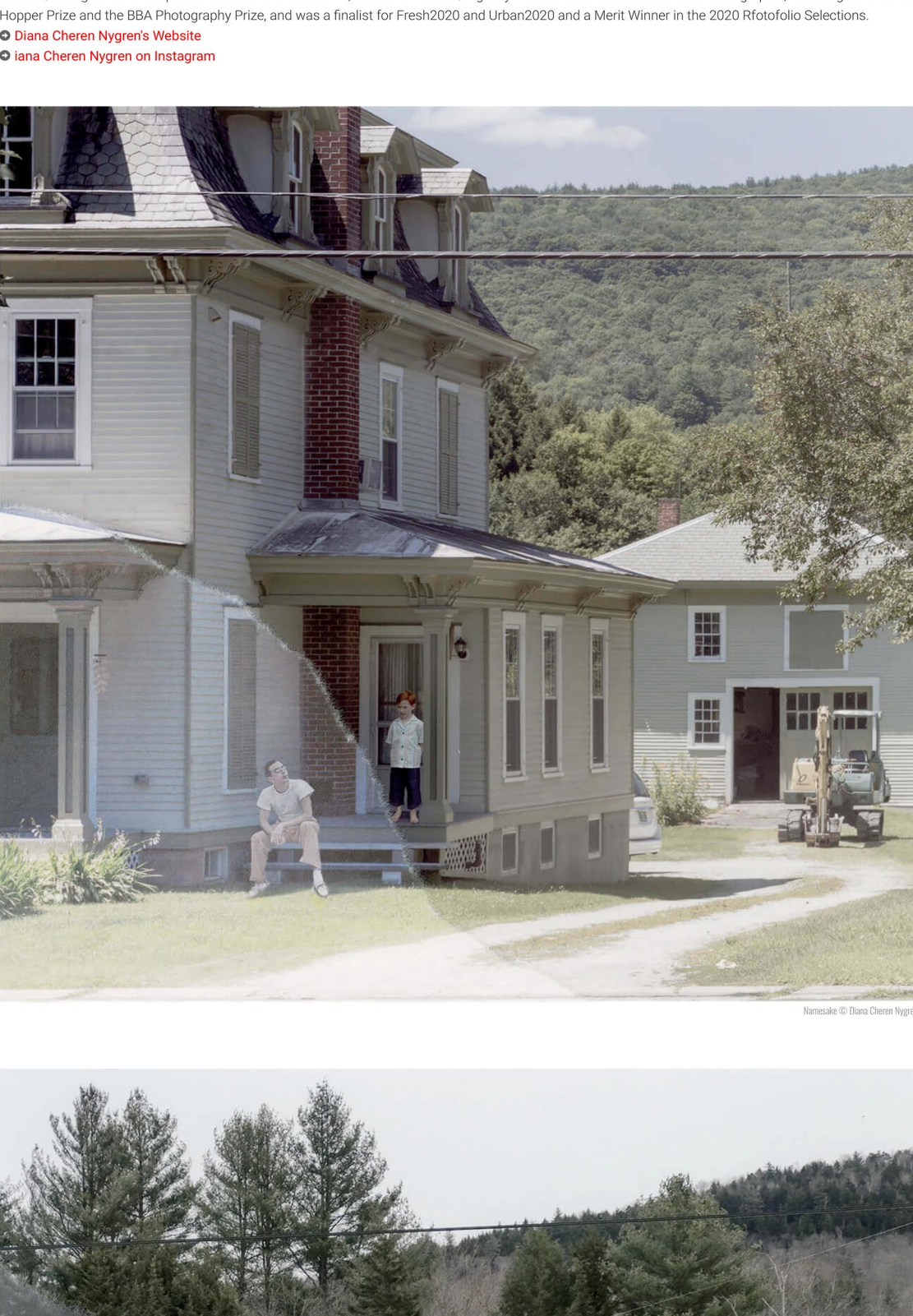
From Out And Up