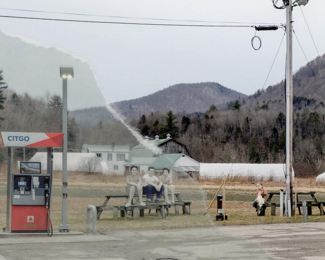
When The Trees Break The Sea