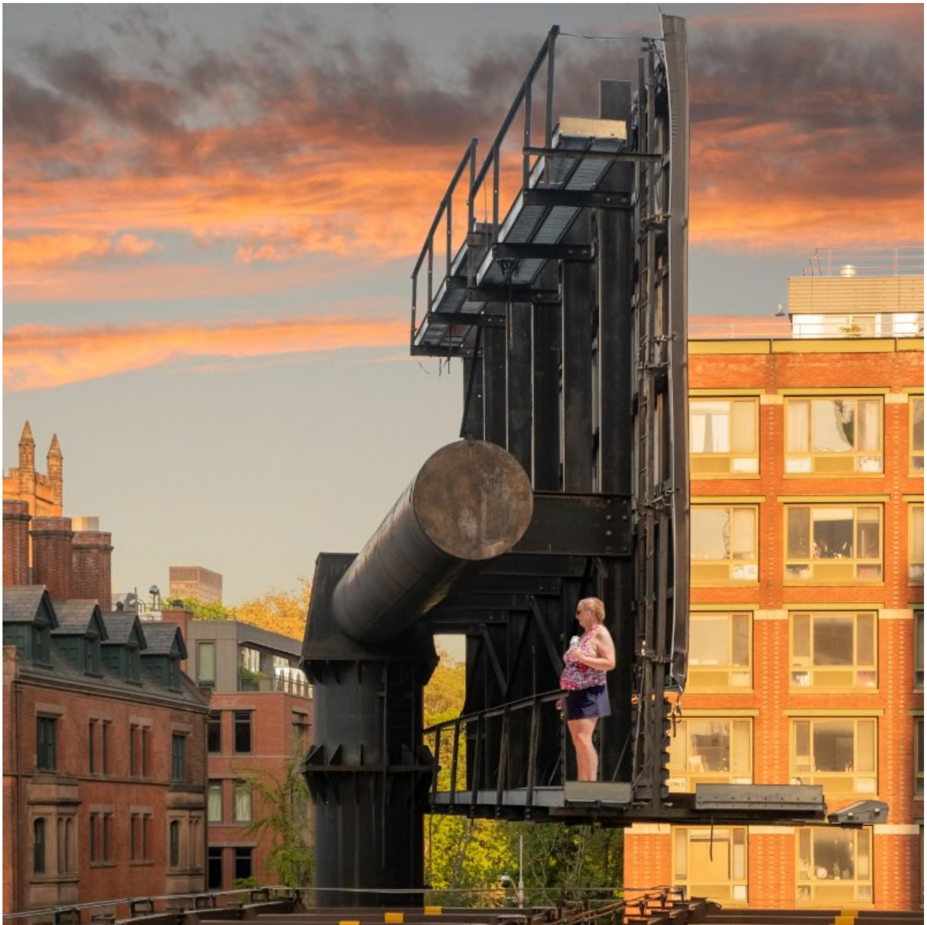
Diana Cheren Nygren, Bottled Water, 2019

In these images, relaxed bathers find themselves in a carefully composed urban environment, where skyscraper roofs become improvised pools and billboards perfect scaffolding for sunbathing. Everything is also charged with dramatic tension, thanks to the apocalyptic skies, which form the backdrop for such new metropolitan habits. These urban